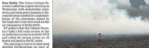
New Delhi: The Union Cabinet Secretary called an urgent meeting on Wednesday with stakeholder ministries and state governments to discuss the steps needed for implementation of the directions issued by the Supreme Court this week on the air emergency in Delhi-NCR.

ET gathers that the Cabinet Secretary held a full scale review of the air pollution scenario in Delhi-NCR and called for strong action on all fronts outlined by the SC order. The meeting is learnt to have held detailed deliberations on each of the directions issued by the Central ministries and departments and state governments. Recognizing the predominance of paddy cultivation in Punjab and Haryana leading to burning of huge amounts of paddy straw every year, the Centre will closely be looking at exploring a Minimum Support Price crop rotation scheme. States have been asked to examine ways to phase out paddy cultivation and switch to alternate crops from next year. The Centre will also examine ways to promote maize cultivation by incentivizing ethanol production.