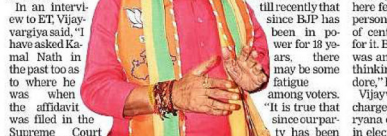
BSP supremo Mayawati

I am cautioning the public about Congress and BJP because both have formed the government in Madhya Pradesh but the picture of the poor and farmers has not changed.